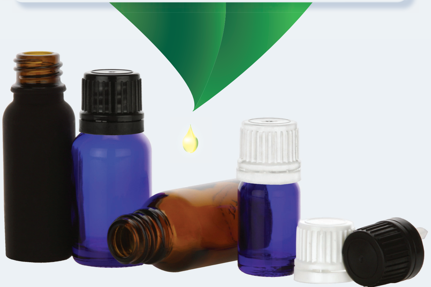
Right: Standard 18mm Finish